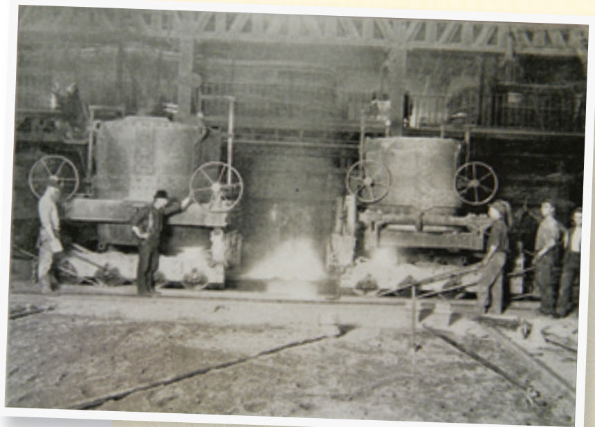
Open hearth furnaces at the Bethlehem Steel Company ca. 1900.