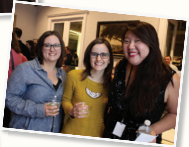
Young Friends members celebrate the Creepy Collections and Collections program in November 2015.