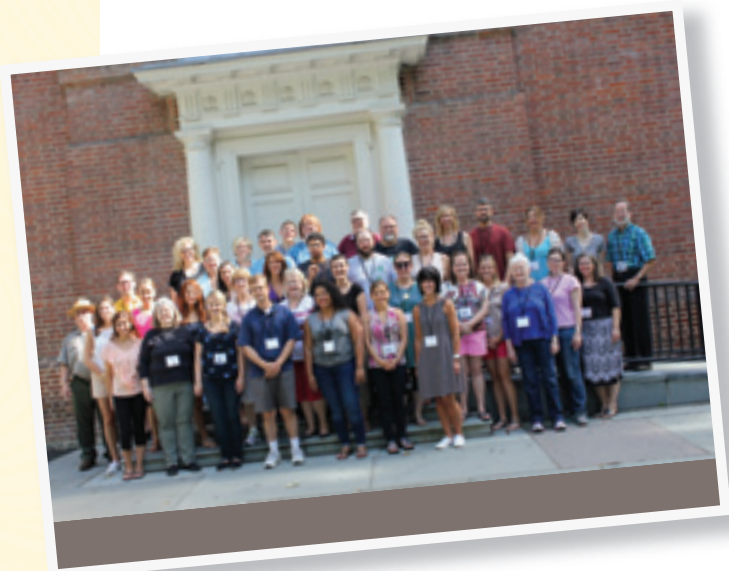
Educators take a break from the Cultures of Independence workshop to pose for a group portrait.