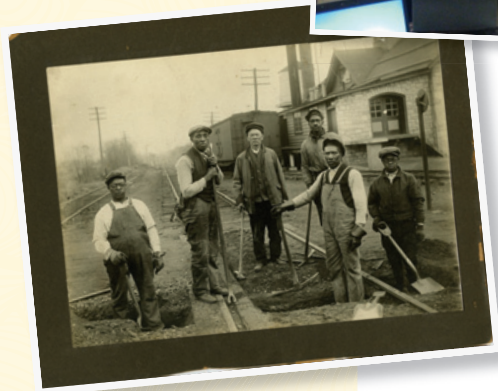
Baltimore and Ohio Railroad Crew ca. 1920s.