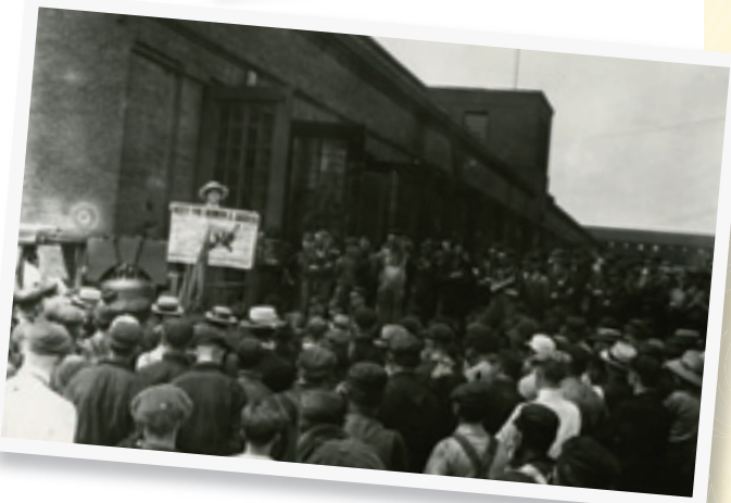
Women campaign for the right to vote during the Women's Liberty Bell Tour of 1915.

Work concluded recently on HSP's Hidden Collections Initiative for Pennsylvania Small Archival Repositories . In partnership with the Andrew W. Mellon Foundation, the goal of the project was to make better known and more accessible to researchers the often hidden collections held by small, primarily volunteer-run archival repositories in the Philadelphia area. The project began in July 2011 and wrapped up in September 2016, during which project staff surveyed 172 small repositories and created finding aids to nearly 1,500 individual archival collections.