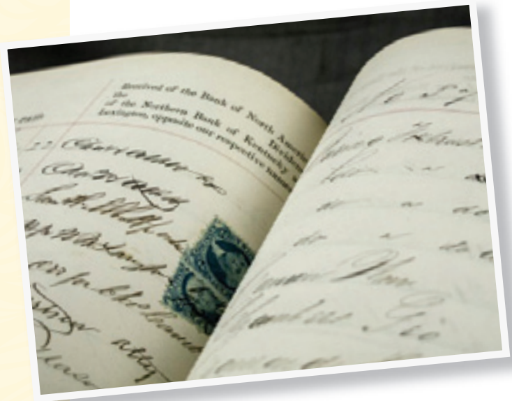
Revenue stamps in a ledger from the Bank of North America records [1543].

To learn more about HSP's collections, visit hsp.org/Collections