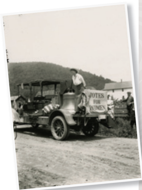
Women campaign during the 1915 Women's Justice Bell tour to drum up support for a state constitutional amendment giving women the vote.