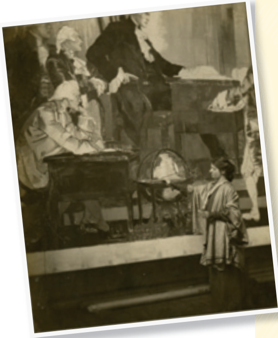
Violet Oakley takes a break from her work in this undated photograph.