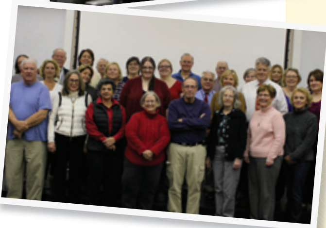
On the eve of commencement, graduates of the Foundations of Genealogy course pose for a class portrait.