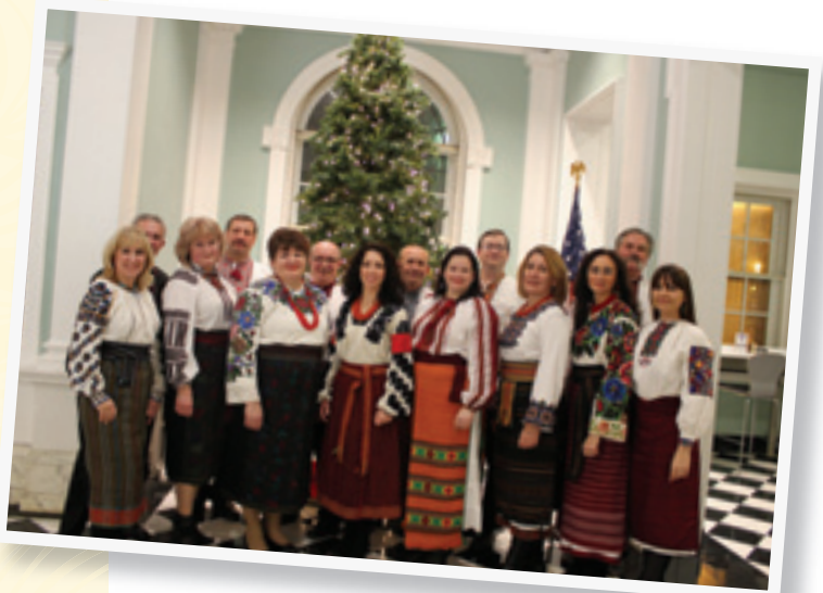
Members of the Accolade Chamber Choir gather before performing as part of HSP's Catholic Philadelphia program.

To learn more about HSP's programs and publications, visit hsp.org/Calendar and hsp.org/Publications