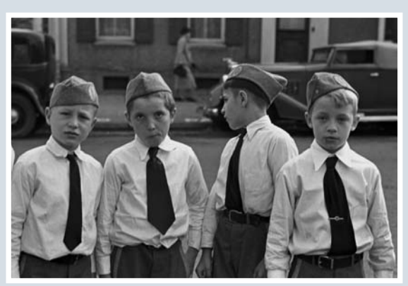
Bethlehem boys, Sons of the American Legion

Once a week most children of the 1930s and '40s shopped at the Bethlehem Market with their families