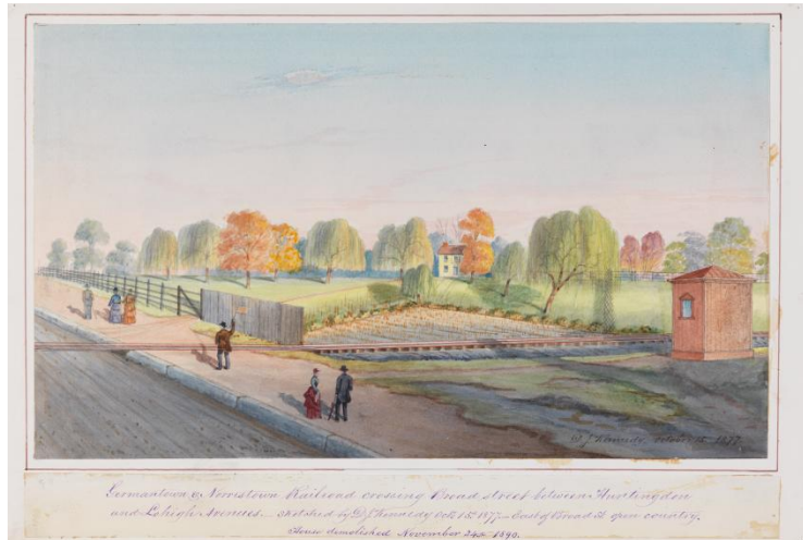
Germantown and Norristown Railroad Crossing, October 15, 1877 (4435)

http://digitallibrary.hsp.org/index.php/Detail/Object/Show/idno/4435