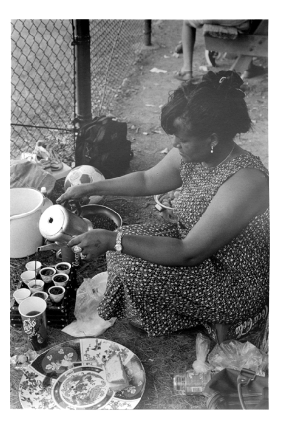
Ethiopian coffee at an ECAGP picnic

Although a source of help and comfort to African immigrants, community associations, especially those based upon ethnic criteria, may serve to recreate divisions present in home countries. A Sierra Leonean immigrant notes that this has been a problem in his own community in Philadelphia: "One of the problems in Africa is tribalism. We have left home to come here, and we begin to divide ourselves into Mendes,