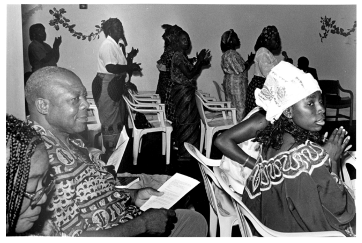
Liberian Church. Photograph by Vera Viditz-Ward