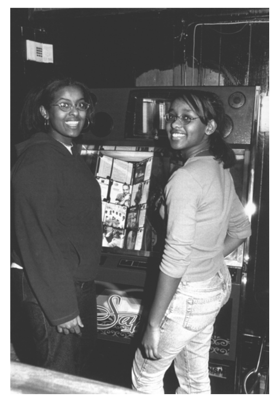
Eritrean youth socialize at Asmara ConXion

When they see other children outside of the classroom, it is at an event organized by their community. A father who helped found the Guinean Association in Philadelphia saw the role that such an organization could play in socializing his children, who have an American mother:" Now we are beginning to create links between the second and first generations. One of my own motivations for creating the association was that I wanted my own kids to be introduced into the Guinean community." Some African communities dream of having a daycare center