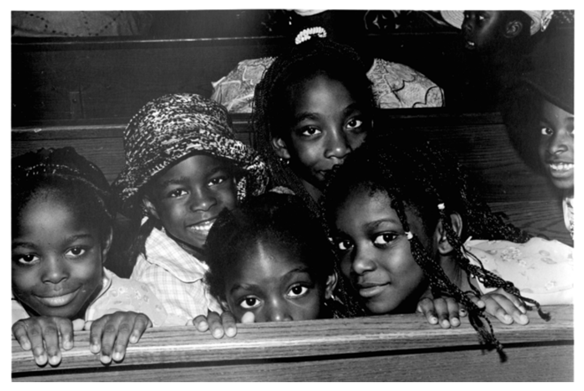
Yoruba children at Christ Apostolic Church.

Despite the separation they feel from Africa and its traditions, younger generation Africans do feel that they are different from their American peers. They enjoy their knowledge of two cultures, and feel that they have greater options about where and how they will live their adult lives. They interact well in mixed generational groups, which is the norm for their community gatherings. And they tend to have a respect for their elders which is uncommon in our American, youth-oriented society. A young Eritrean woman put it this way: "So we young people try to keep the culture, but we also know that there is a lot of culture and traditions that we don't agree with. So you would like to keep some things, like family values and the respect we have for each other, and the closeness we have. Things like that we try to teach."