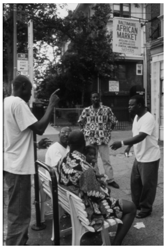
Socializing outside Baltimore African Market

Other kinds of businesses appeal to the African community by offering services they especially need or by hiring personnel who speak African