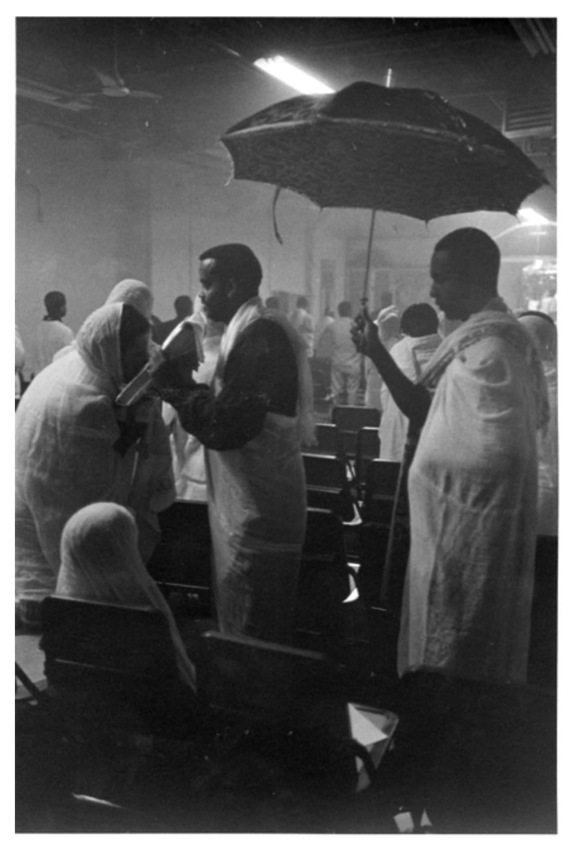
Ritual for worship at the Ethiopian Orthodox Church.