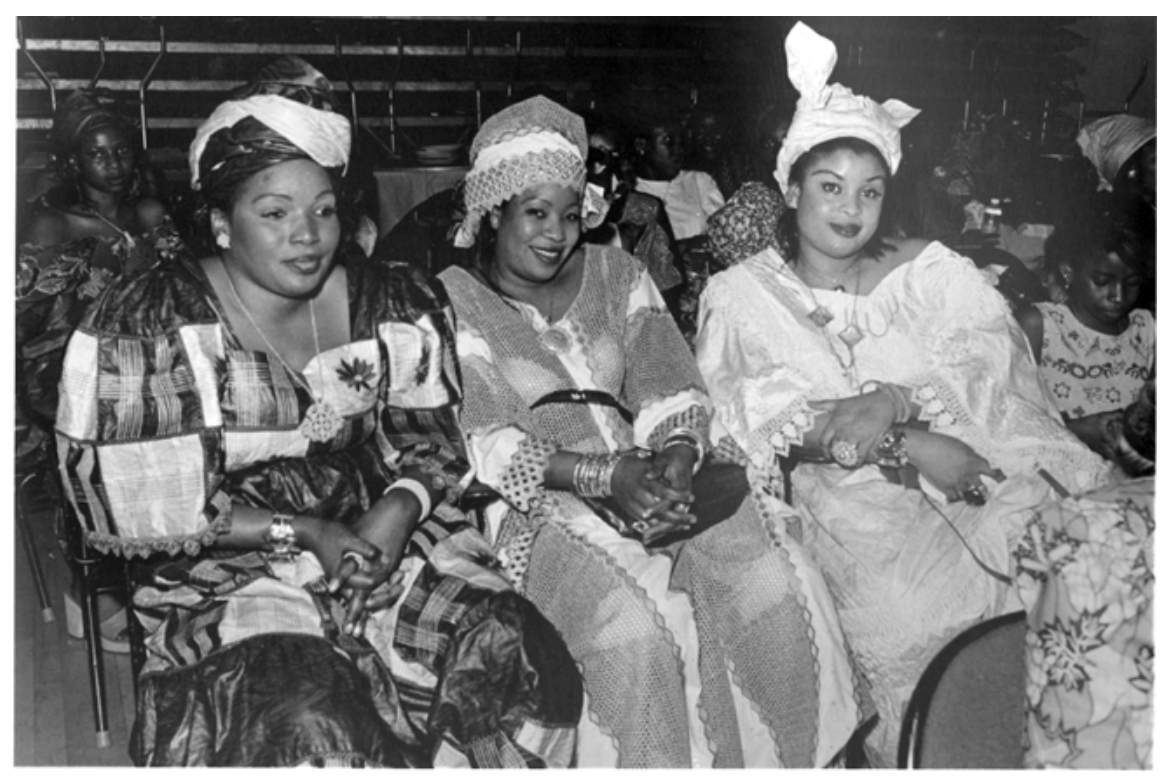
Ivorian women at soireé dansante.

Sometimes, communities will hire live musicians, who often come from New York or Washington D.C. At a recent Eritrean event, a live band played at the Eritrean community center into the small hours of the night. People of all ages joined in the exuberant dancing while small children slept on chairs around the periphery of the dance floor, finally tired out from their earlier active participation. People often comment nostalgically after such events that they "felt just like being back home."