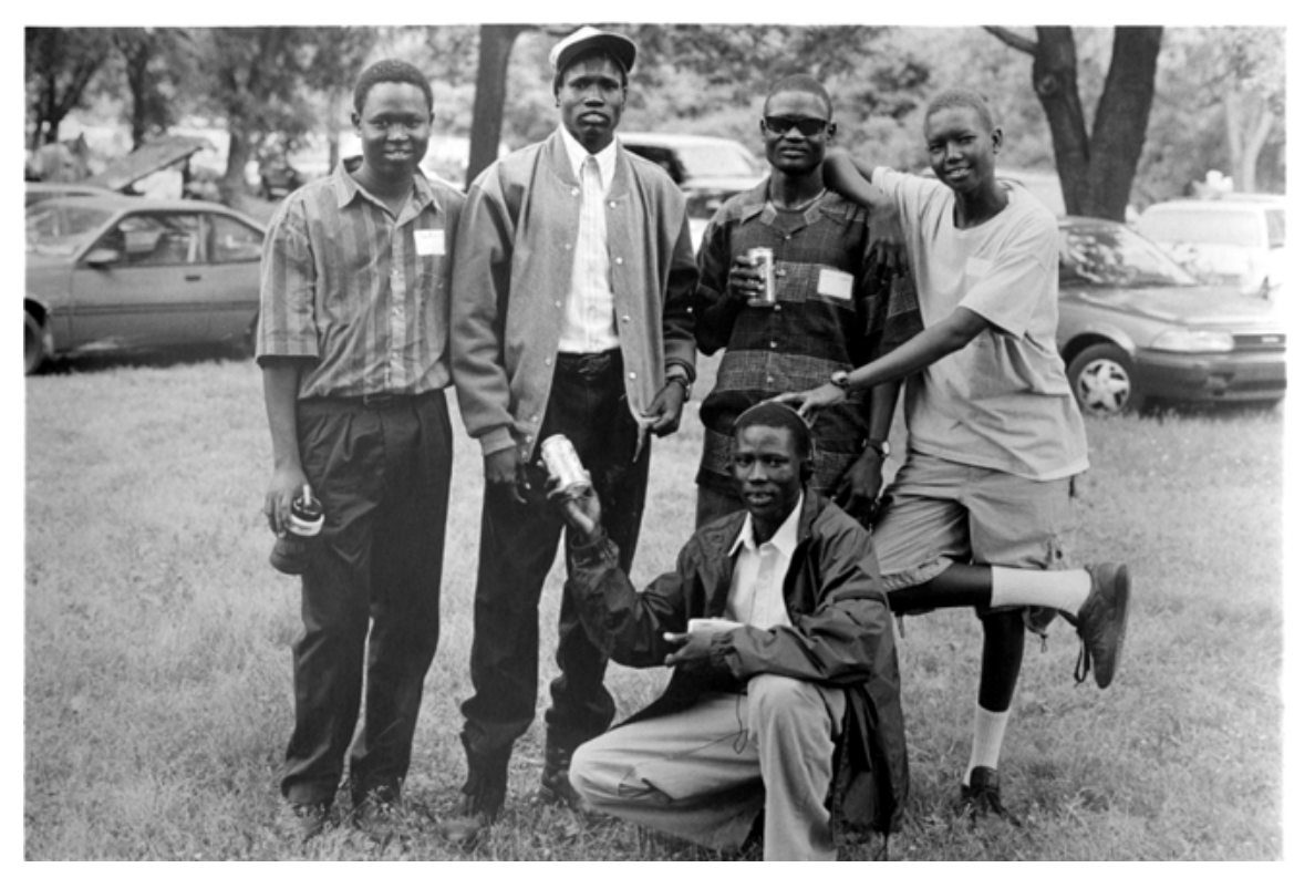
Sudanese refugee youth, Fairmount Park.

Refugees experience special challenges upon arriving in the United States. At the same time that they need to adapt to a new society, they are recovering from the trauma of war or