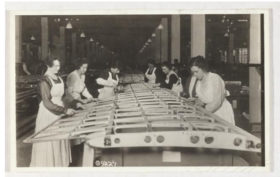
Women in Industry photograph (10711)

Women in Industry (Misc) [Philadelphia War Photograph Committee] [electronic resource] by Philadelphia War Photograph Committee Published 1917 Call Number: 10711 Digital Library link: http://digitallibrary.hsp.org/index.php/Detail/Object/Show/idno/10711