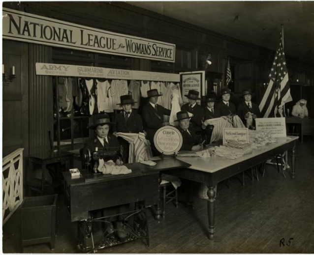
National League for Woman's Service photograph (11142)

Digital Library Link: http://digitallibrary.hsp.org/index.php/Detail/Object/Show/idno/11142