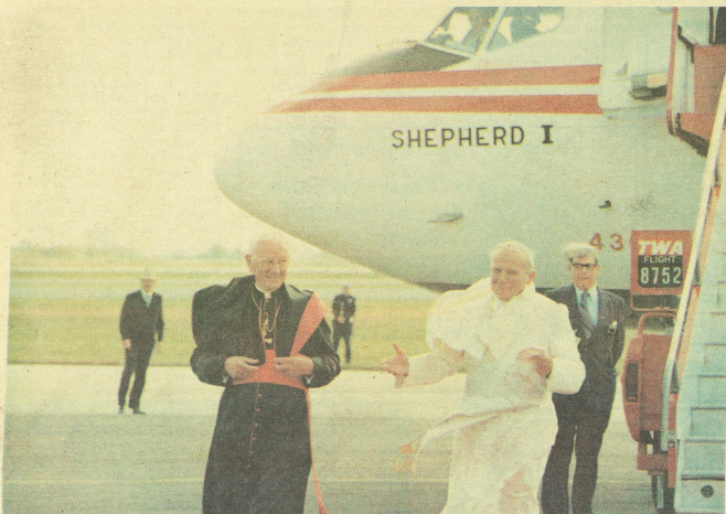
CARDINAL KROL escorted Pope John Paul II from TWA's Shepherd 1 at Philadelphia International Airport where the pontiff arrived an hour late from New York on Oct. 3.