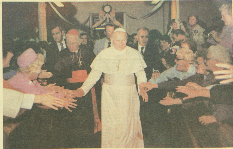
A HAPPY CONGREGATION greeted Pope when he arrived with Cardinal Krol early Thursday morning at the tomb of St. John Neumann at St. Peter's Church, 5th and Girard ave.