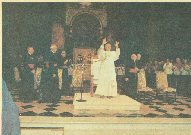
GOD BLESS PHILADELPHIA — Pope John Paul acknowledges the cheers of Philadelphians in the Cathedral-Basilica of SS. Peter and Paul for the first pontiff ever to invoke God's blessing on the city while visiting it.