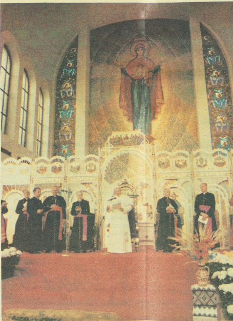
UKRAINIAN CATHOLICS in Philadelphia were greeted by Pope John Paul on Oct. 4 at the Cathedral of the Immaculate Conception, 816 N. Franklin st.