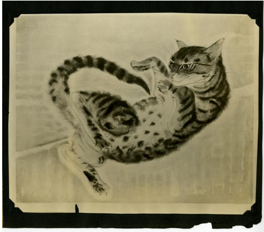
(The Print Club Scrapbooks. HSP Digital Image #5498)