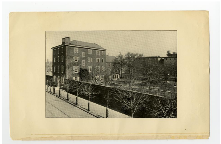
View of the Magdalen Society (below) #6079

An act incorporating the Magdalen Society in the city of Philadelphia